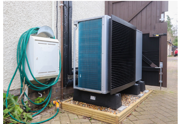
Air source heat pump unit located down the side of a property in Letchworth behind an existing gate.

Whilst our consent is not required for internal alterations, please be aware that there may be internal considerations involved when considering the installation of an ASHP.