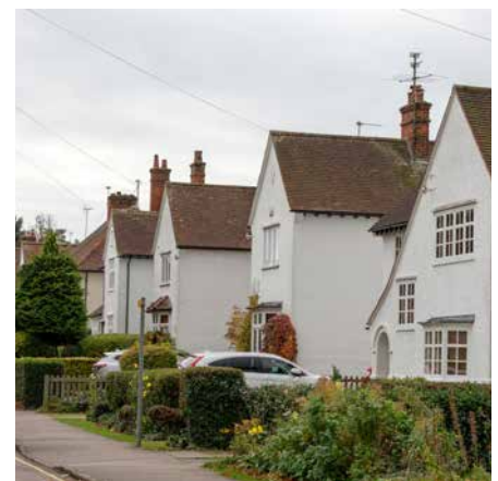
Lytton Avenue, Letchworth