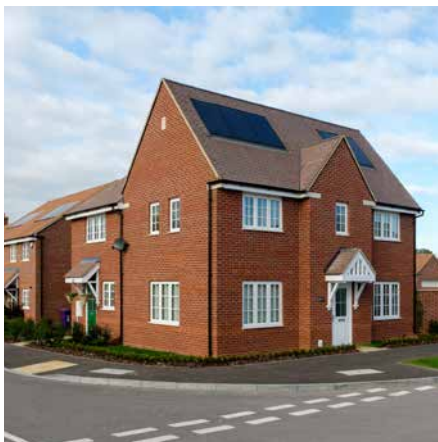
Cedar Avenue, Letchworth

Letchworth Garden City was built on pioneering and innovative principles. When assessing proposals for new development, it is important that this pioneering spirit is recaptured. An important element of this is ensuring that new development meets the highest standards of sustainability and minimises its long term impact on the environment.