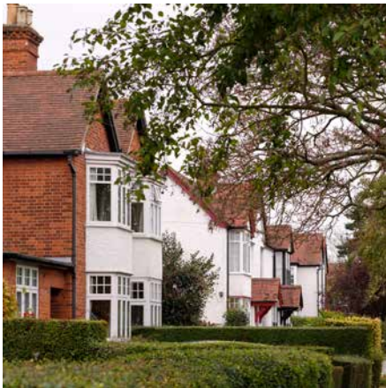
Lytton Avenue, Letchworth