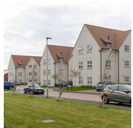
Ashfield Drive, Letchworth