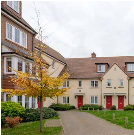
Lindsell Avenue, Letchworth