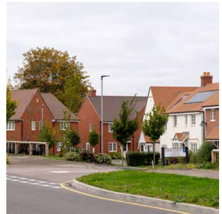
Cedar Gardens Letchworth