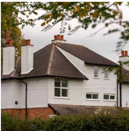
Meadow Way, Letchworth