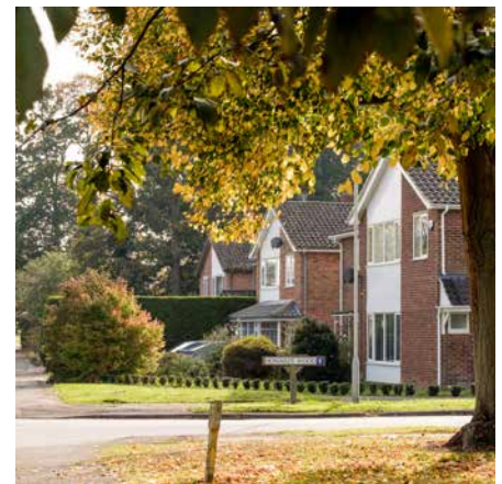
Howard Drive, Letchworth