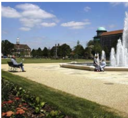
The Gardens today

This shows how places can change over time.