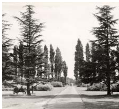
The Gardens 70 years ago