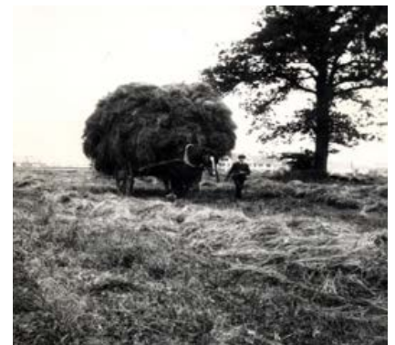
The Gardens 110 years ago (when it was used as farmland to grow wheat)