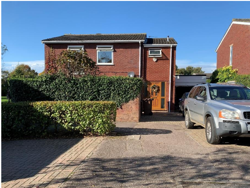
Figure 3 – Supporting Photos