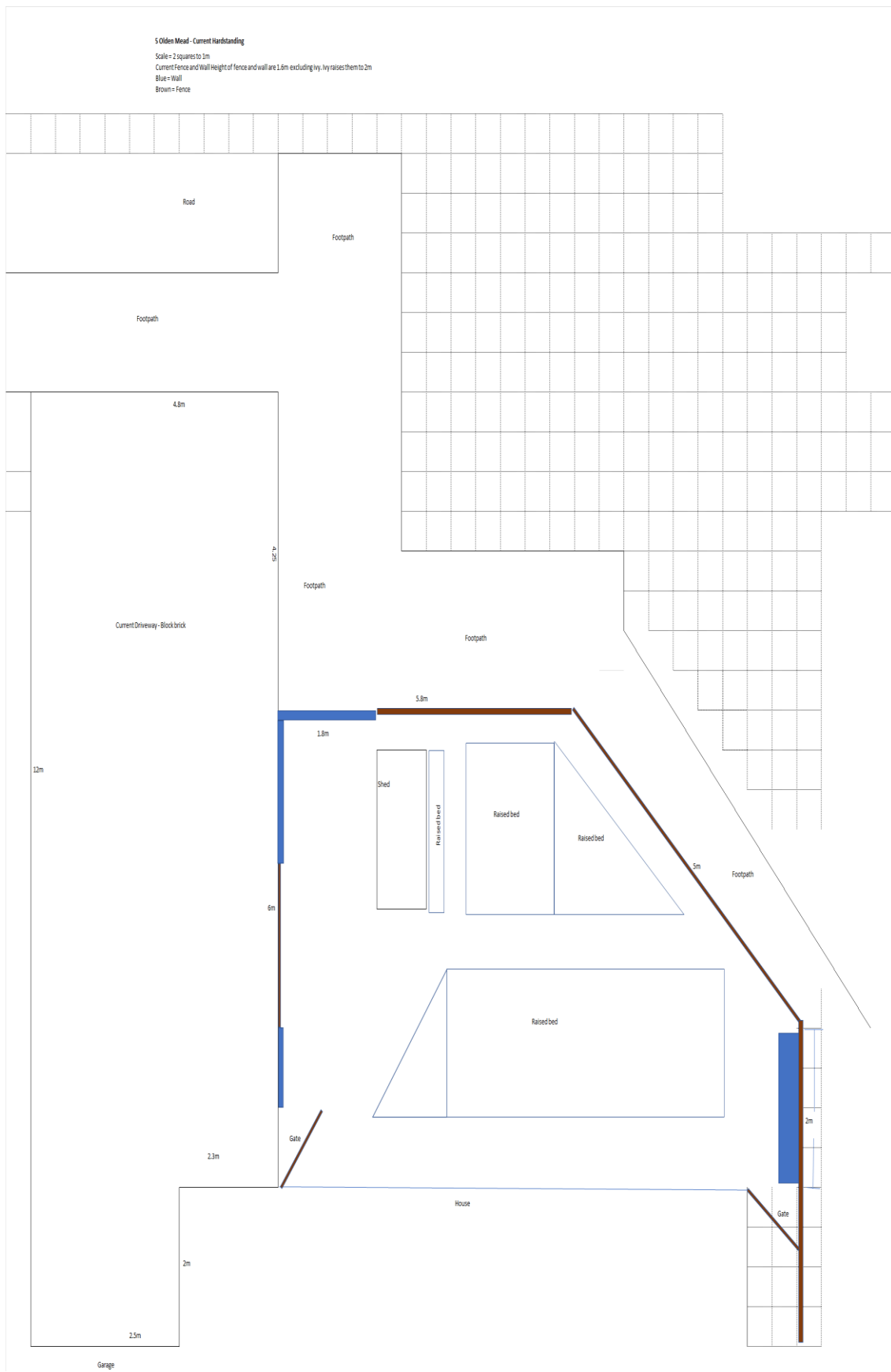
Figure 1 – Current Hard Standing & Front Garden